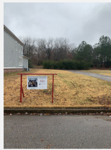
Construction slab at the end of Magilbra