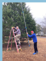
CTT HOA Board members taking Christmas Tree Lights down