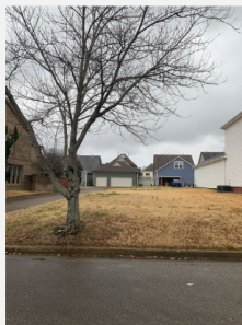
Two empty lots on Cullendale.